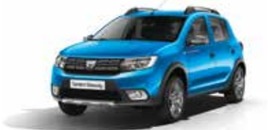
Azurite Blue (RPL)