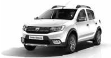
Glacier White (369)