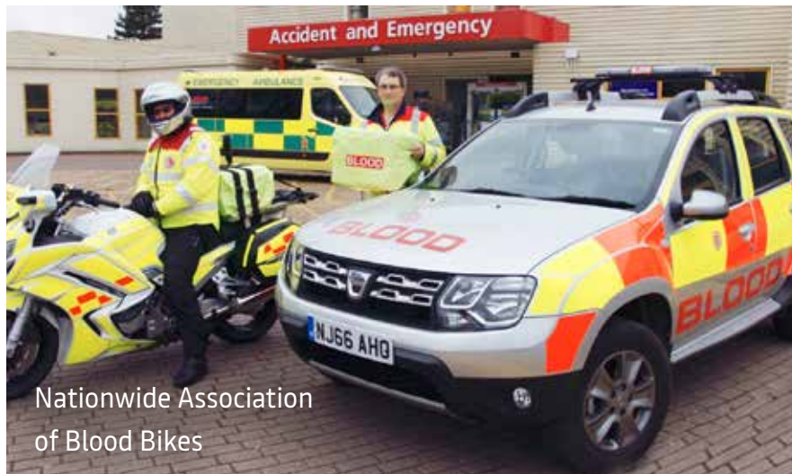
Nationwide Association of Blood Bikes

For us, going the extra mile doesn't stop at making great value cars. We take great pride in playing an active part in the community and giving back to communities throughout the UK. We support the life-saving work of the Nationwide Association of Blood Bikes. We proudly support Future Terrain, a charity that helps injured ex-service personnel back into employment through motorsport and vehicle engineering. We get stuck in as the official partner of Rugby League. Now the proud sponsors of the Nation England Rugby League teams for Men, Women, Wheelchair and Youth. We also run Dacia Days, which are full of fun and games for our amazing Dacia drivers - keep up to date with us on Facebook, Twitter, Instagram and our YouTube channel.