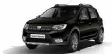
Pearl Black (676)