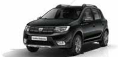
Slate Grey (KNA)