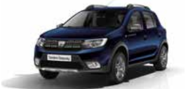
Cosmos Blue (RPR)