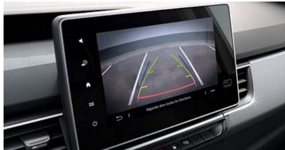
rear-view camera. It provides a rearward view on the easy link screen or the interior rear-view mirror when you engage reverse gear. Superimposed outlines make your manoeuvres easier and safer.