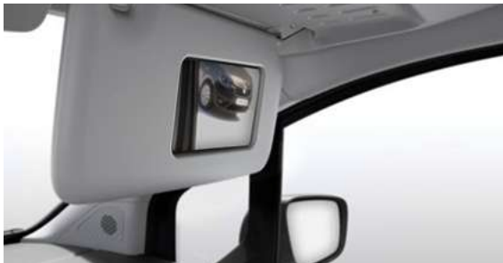
wide view mirror. Located in the passenger sun visor, it improves your vision and helps to minimise the effect of blind spots at Y-junctions. Available as standard on Advance models.