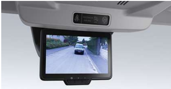
rear view assist. Via a digital screen – instead of the interior rear-view mirror – you can view what the camera installed at the rear of your vehicle sees.

All new Renault Kangoo Van comes with twenty optional advanced innovative driving assistance systems. Tried and trusted, it promises a safe and secure driving experience.