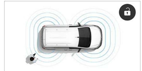
"zoning" function For locking or unlocking either the front doors or the loading area.