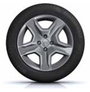
16" 'Stepway' Design Wheels