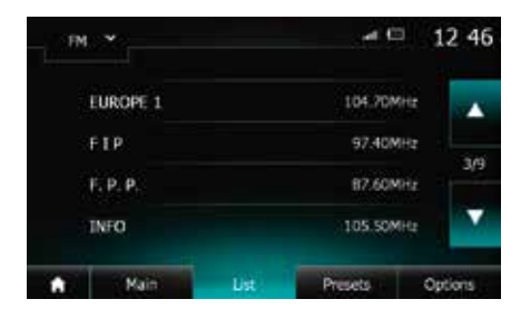
Listen to DAB, FM or AM radio.