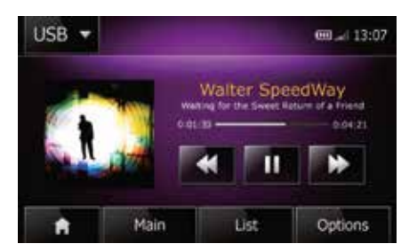
DAB/FM/AM tuner, connect devices via USB and AUX sockets.