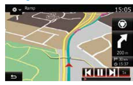
Provided by Navteq with vocal guidance.