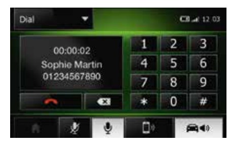
Bluetooth® technology* allows you to make and receive calls on the move.